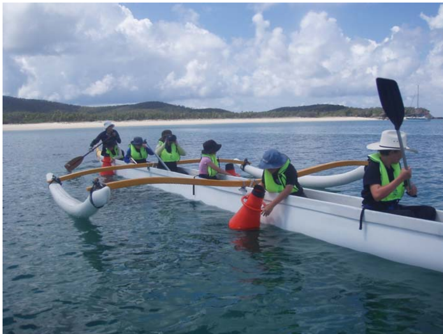
Because of their unique locations and staff expertise, O&EECs provide experiences that are not available within a school setting.

O&EECs provide environmental education experiences at a site or Centre removed from the everyday school or classroom environment. O&EEC principals widely agreed that their Centres offer a specialised service to schools that complements and enhances the school curriculum. This specialised service includes both their unique location in the environment and the specialised expertise of their staff. Many programs are designed thematically around the environments surrounding the Centres (e.g., coastal and marine studies, dry forest studies, rainforest habitats, dry/arid climate studies, studies of built environment, sustainable land uses and practices). The settings in which O&EECs are located, the facilities they offer, and their specialist staff expertise, enable students to participate in learning activities that they are unable to experience at school, such as residential camps, wilderness treks, reef and marine studies.