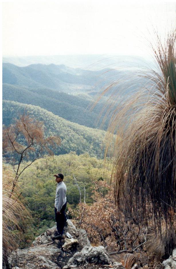
Target programs represented a range of locations throughout Queensland

These instruments are included in Appendix B.