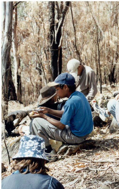
Teachers consider ‘hands on’ learning to be one of the most powerful aspects of O&EEC programs

Learning by doing. Teachers often used the words “hands on” to describe the aspects of the program they considered had the greatest impacts on student learning. This included exploring, investigating, collecting data, and learning new skills.