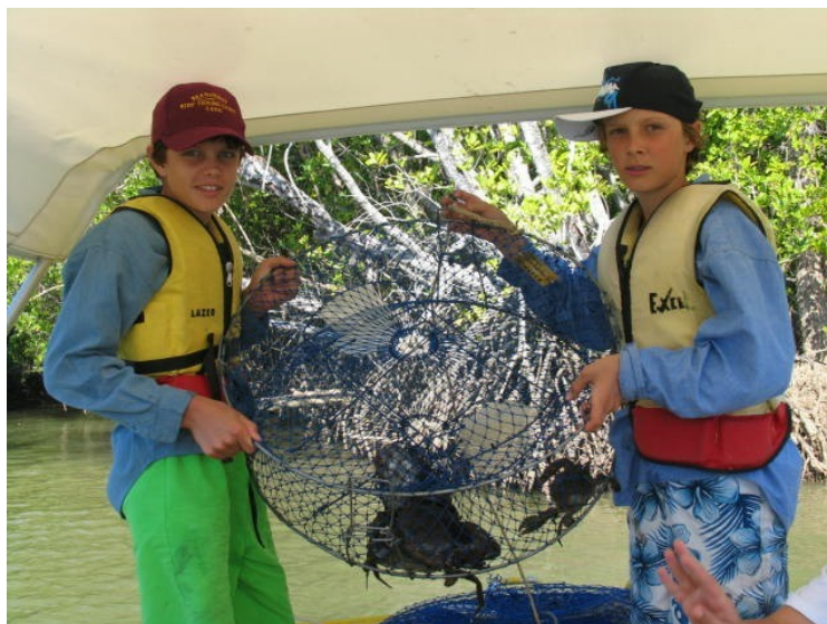
Experience-based learning, the fifth pedagogy, encapsulates the unique strategies that are the specialty of Outdoor and Environmental Education Centres

There were some examples of whole school communities who had developed long-term partnerships with O&EECs. These partnerships then became an ongoing part of the school culture.