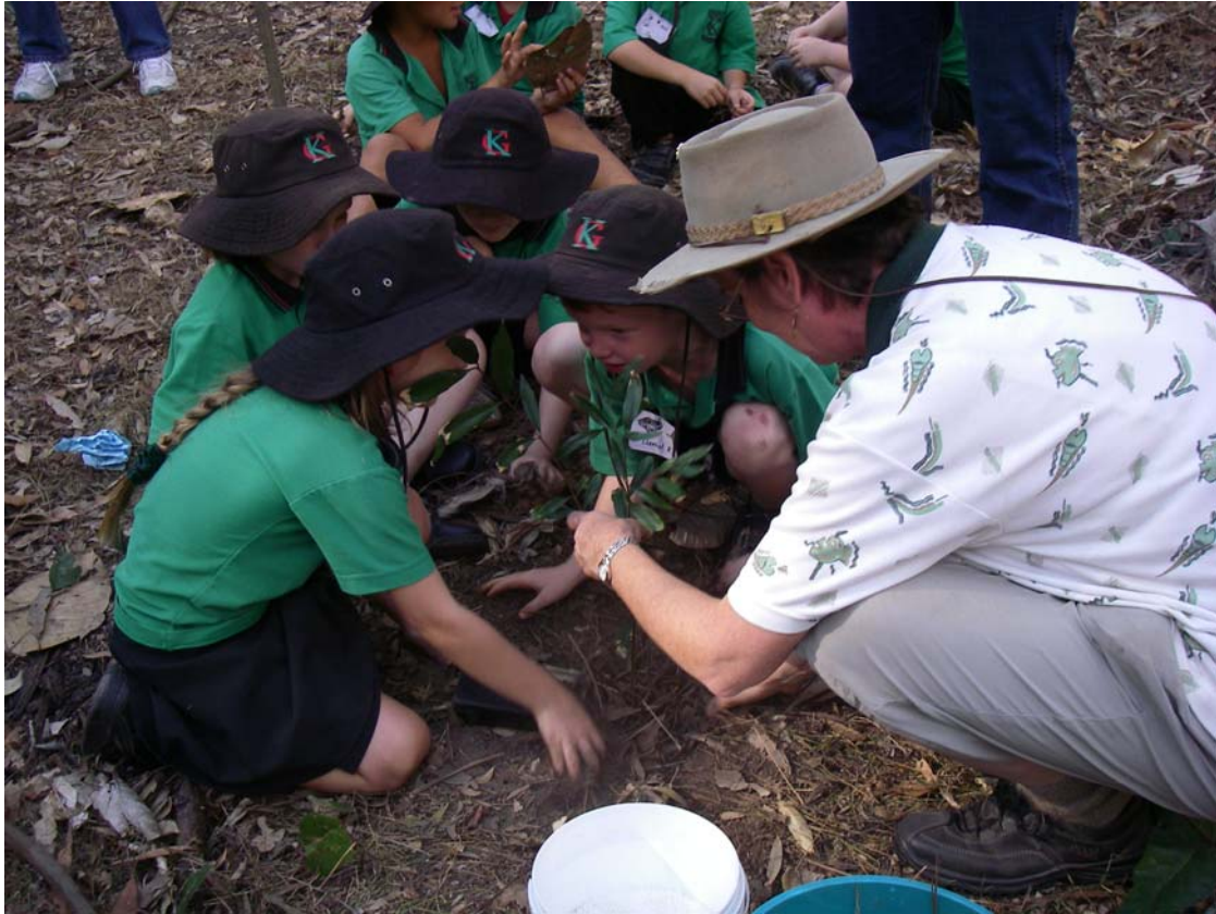
O&EEC programs provide a point of entry, leading to long-term partnerships between Centres and whole school communities