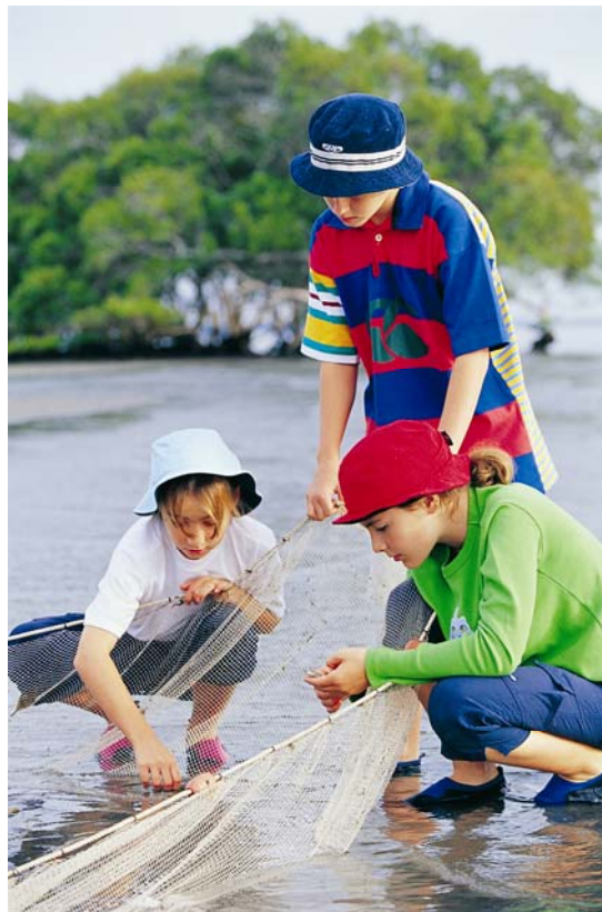
Experience-based learning draws on what students see, hear, do and feel

For each learning event, students were asked to indicate what it was that helped them to learn or change. Their responses were coded as either teacher-directed learning (including the teacher, other adults, stories and printed information) or experience-based learning (including what I saw, what I did, what I felt, what I experienced, listening to nature, creative and reflective responses). Students identified that 49% of all learning events were learned through experience; 31% through teachers; and 20% through a combination of both.