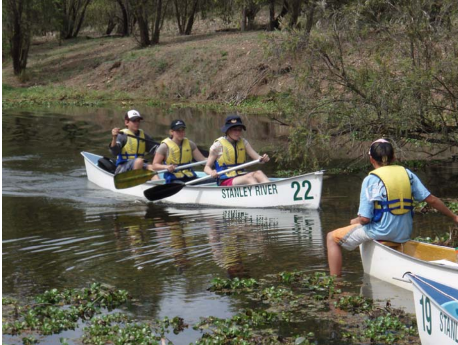
Being in the environment is an important part of the learning experience

Being in the environment. Actually being in the environment – seeing its beauty, seeing the effects of drought or human activity – had an impact on students, according to their teachers. Seeing the environment helped students to visualise and understand the issues and to grasp the scale and importance of the problems. Just being outdoors and out of the classroom had an impact on student learning according to some teachers.